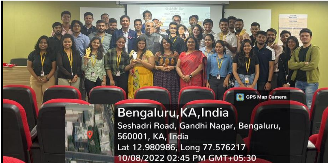
Startup Pitch '22 Series – I on 8th October 2022 - Group Photograph with winners of Startup Pitch '22 Series – I at the Seminar Hall – I 10 AM to 3 PM