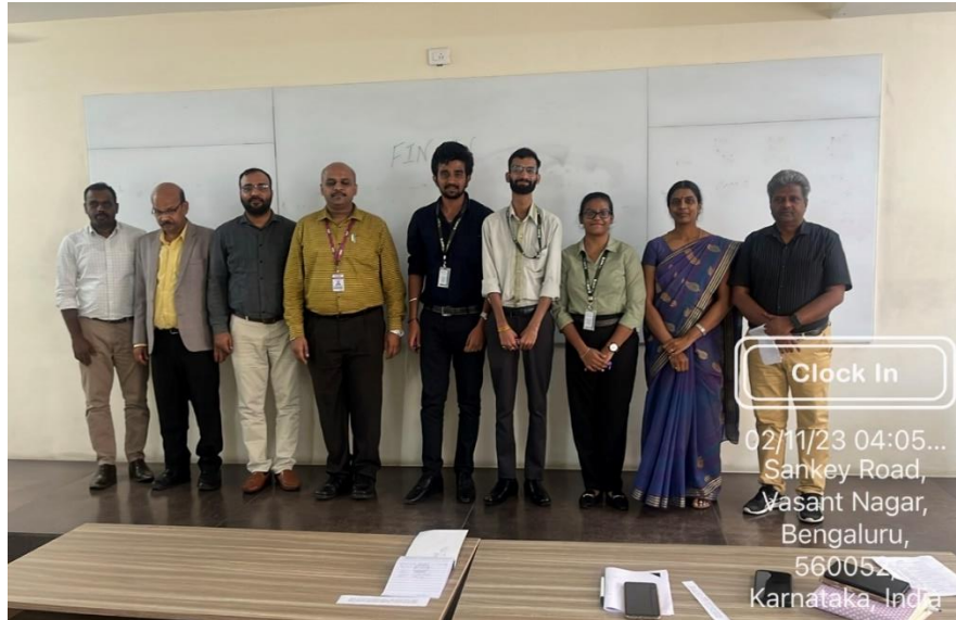
Fig:3 Event: FIG-FIN WIN; Date: 02.11.2023; Venue: LH-202, CMS Business School, Sheshadri Road, Gandhi Nagar, Bengaluru – 560009. 17. POSTER