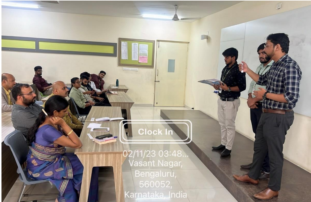
Fig:1 Event: FIG-FIN WIN; Date: 02.11.2023; Venue: LH-202, CMS Business School, Sheshadri Road, Gandhi Nagar, Bengaluru – 560009.