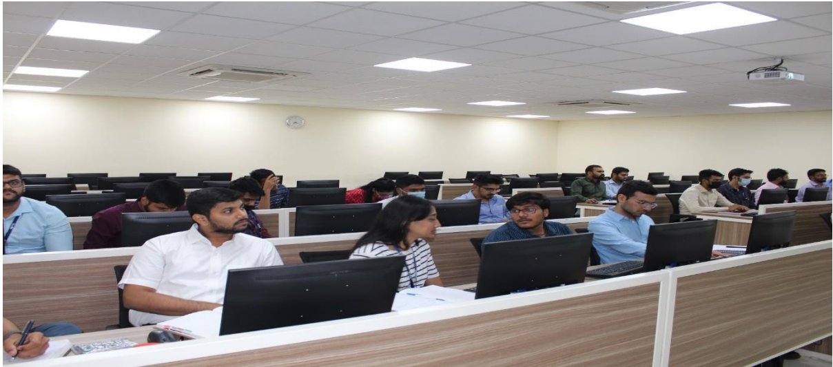
Fig 1.2. – FIG Activity –04-03-2022 – Participants – Computer Lab 206