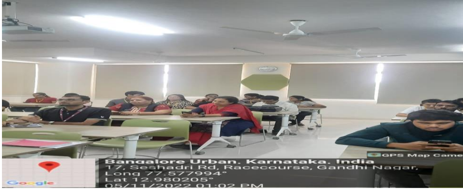
Figure 1.3 FIG Activity- Corporate Boardroom in the Classroom organized on 5 November 2022. Faculty: