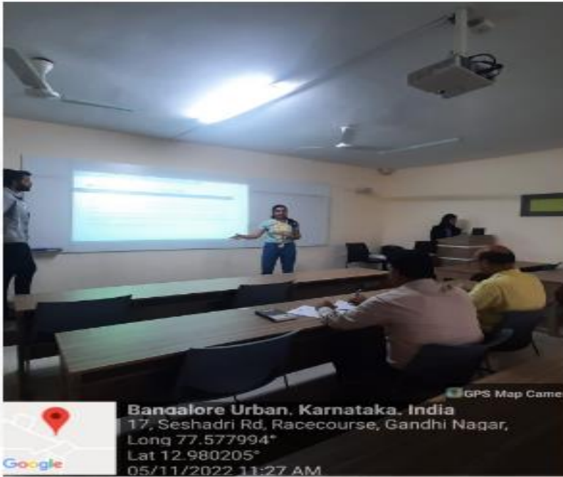
Figure 1.1: Students presented their ideas in FIG Activity- Corporate Boardroom in the Classroom organized on 5 November 2022.