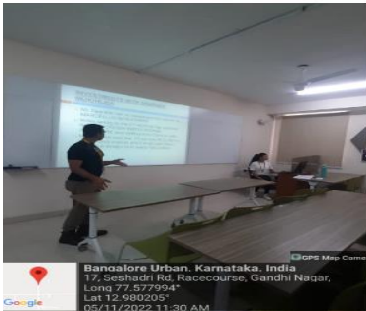
Figure 1.2: Students presented their ideas in FIG Activity- Corporate Boardroom in the Classroom organized on 5 November 2022.