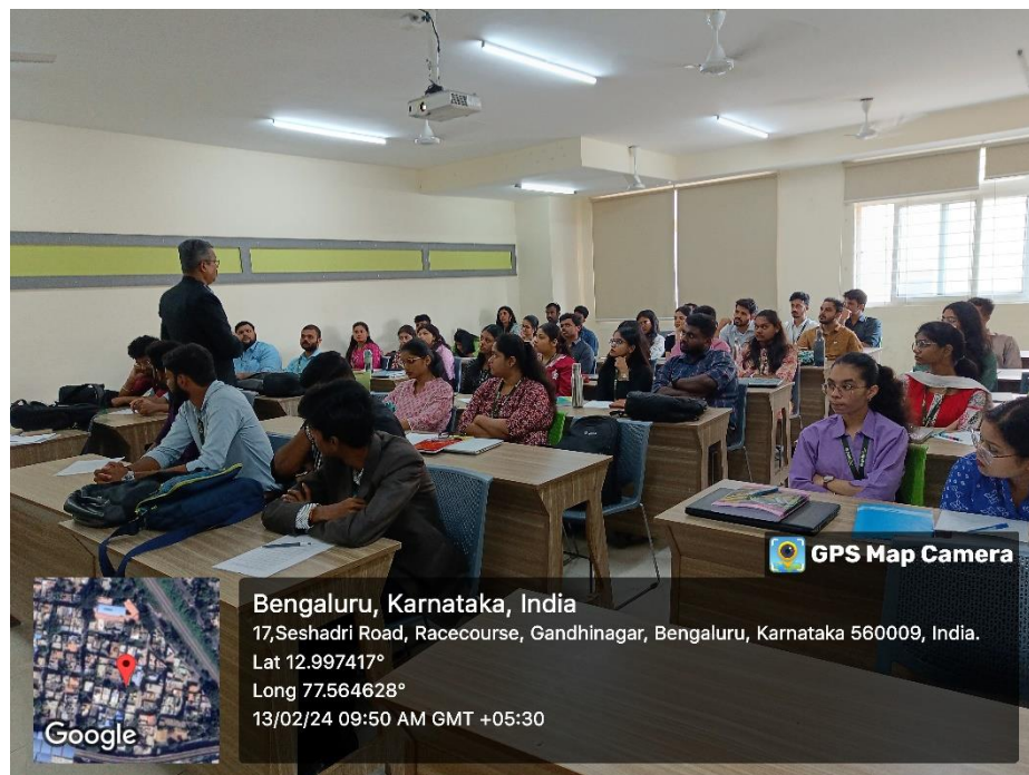
Fig 3: Event: Crafting Wealth Strategies: Demystifying Mutual Funds; Date:13/02/2024; CMS Business School, Sheshadri Road, Gandhi Nagar, Bengaluru – 560009.