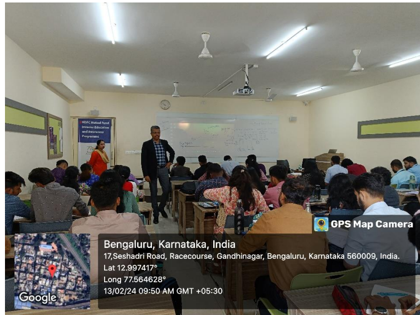
Fig 2: Event: Crafting Wealth Strategies: Demystifying Mutual Funds; Date:13/02/2024; CMS Business School, Sheshadri Road, Gandhi Nagar, Bengaluru – 560009.