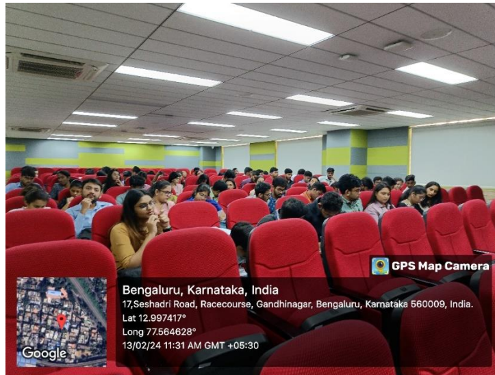
Fig 3: Event: Diversifying Career Opportunities in Investments and Financial Services; Date:13/02/2024; CMS Business School, Sheshadri Road, Gandhi Nagar, Bengaluru – 560009