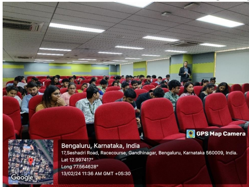
Fig 2: Event: Diversifying Career Opportunities in Investments and Financial Services; Date:13/02/2024; CMS Business School, Sheshadri Road, Gandhi Nagar, Bengaluru – 560009.