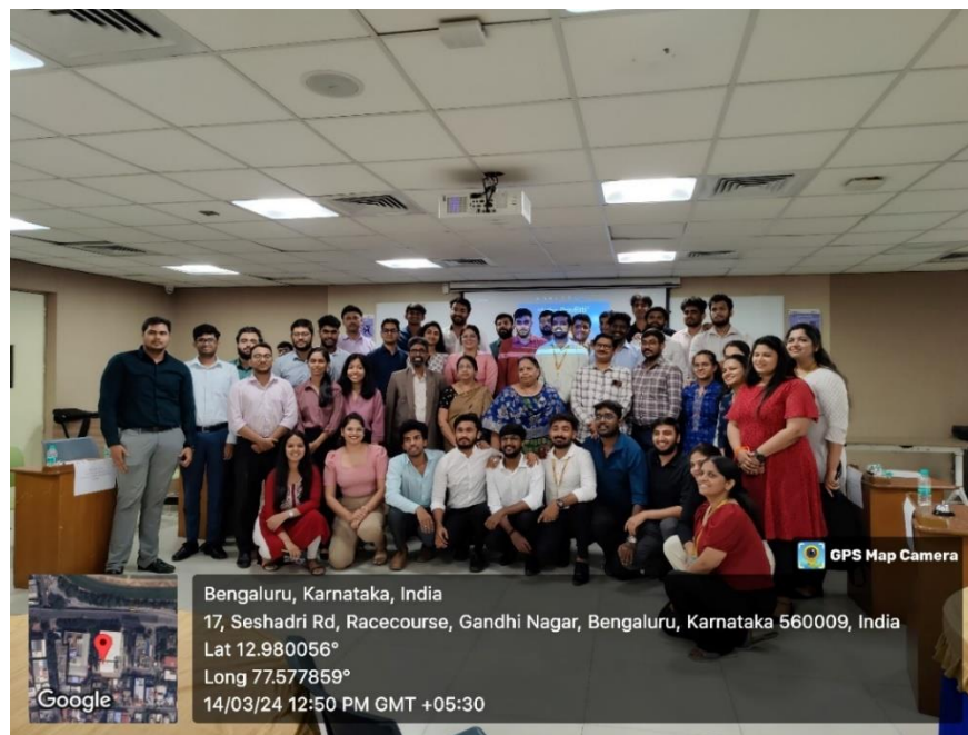
Fig 4: FIG Activity; Event: Artha Pravrtti; Date:14/03/2024; CMS Business School, Sheshadri Road, Gandhi Nagar, Bengaluru – 560009.