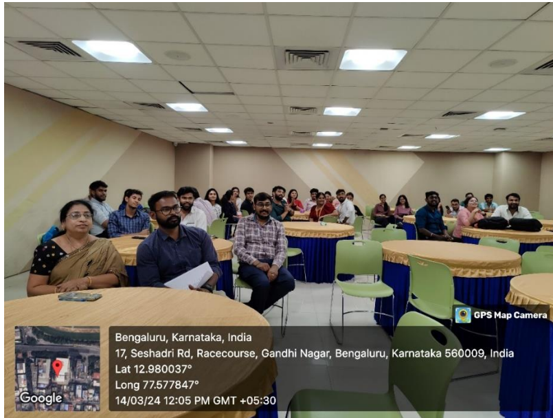
Fig 3: FIG Activity; Event: Artha Pravrtti; Date:14/03/2024; CMS Business School, Sheshadri Road, Gandhi Nagar, Bengaluru – 560009.