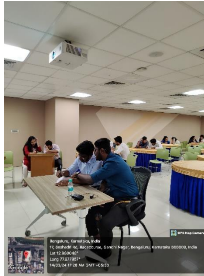
Fig 1: FIG Activity; Event: Artha Pravrtti; Date:14/03/2024; CMS Business School, Sheshadri Road, Gandhi Nagar, Bengaluru – 560009.