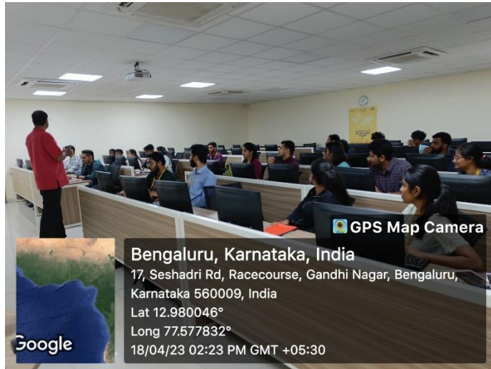
Pic:1 Students of CMS business school participating in the event Introduction to NSE SMART- Online Trading Simulator which was held on 18/04/2023 Thursday (Batch: 2022 -2024) (Class: CF3) 2 nd Semester