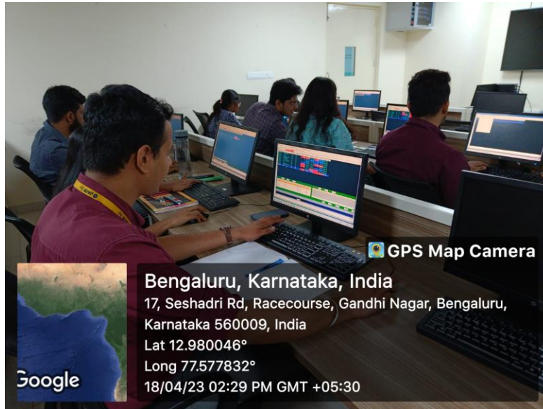
Pic:3 Students of CMS business school participating in the event Introduction to NSE SMART- Online Trading Simulator which was held on 18/04/2023 Thursday (Batch: 2022 -2024) (Class: CF3) 2 nd Semester