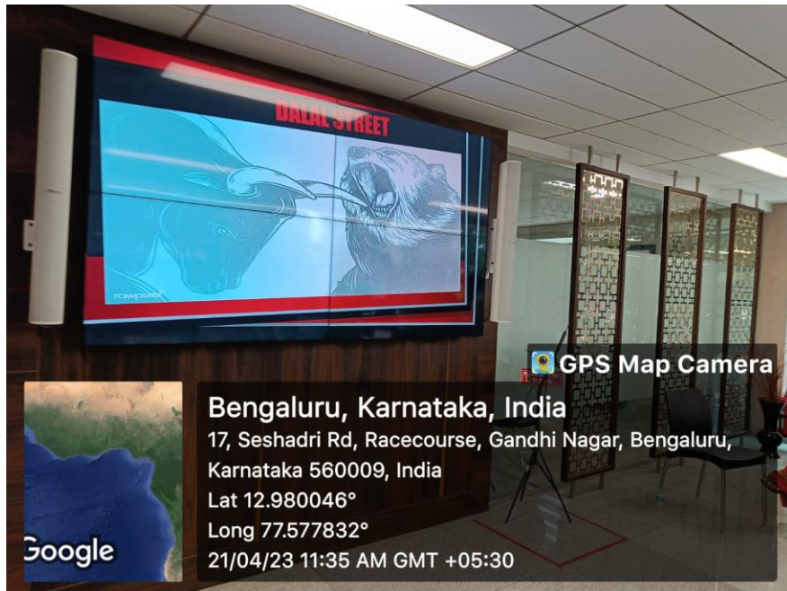
Fig 1: Students of CMS business school and students from outside participated in the event Intercollegiate Mock Stock and Live Trading Competition which was held on 21/04/2023 Friday (Batch: 2021 -2023) 4 th Semester