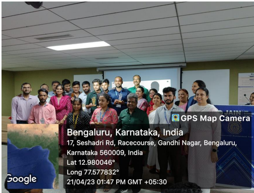
Fig 3: Winners of Intercollegiate Mock Stock and Live Trading Competition