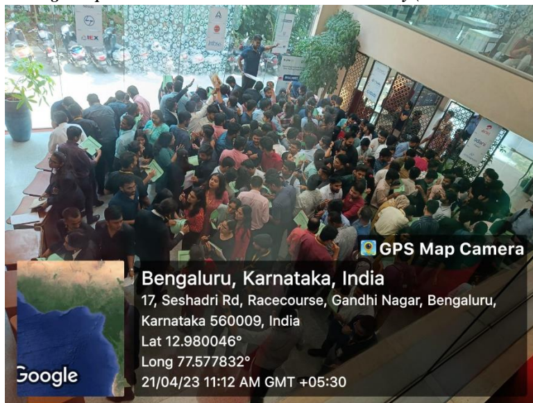
Fig 2: Students of CMS business school and students from outside participated in the event Intercollegiate Mock Stock and Live Trading Competition which was held on 21/04/2023 Friday (Batch: 2021 -2023) 4 th Semester