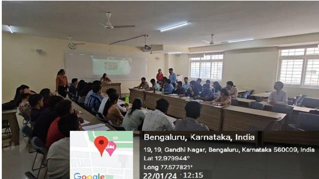
Fig 2: FIG Activity; Event: Mock Parliament - Simulation; Date:22 nd and 24 th January 2024; CMS Business School, Sheshadri Road, Gandhi Nagar, Bengaluru – 560009.