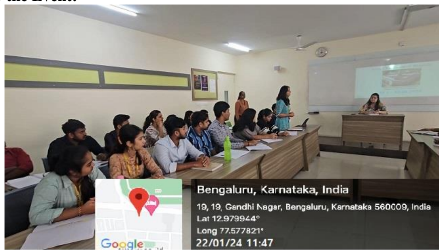
Fig 1: FIG Activity; Event: Mock Parliament - Simulation; Date:22 nd and 24 th January 2024; CMS Business School, Sheshadri Road, Gandhi Nagar, Bengaluru – 560009.