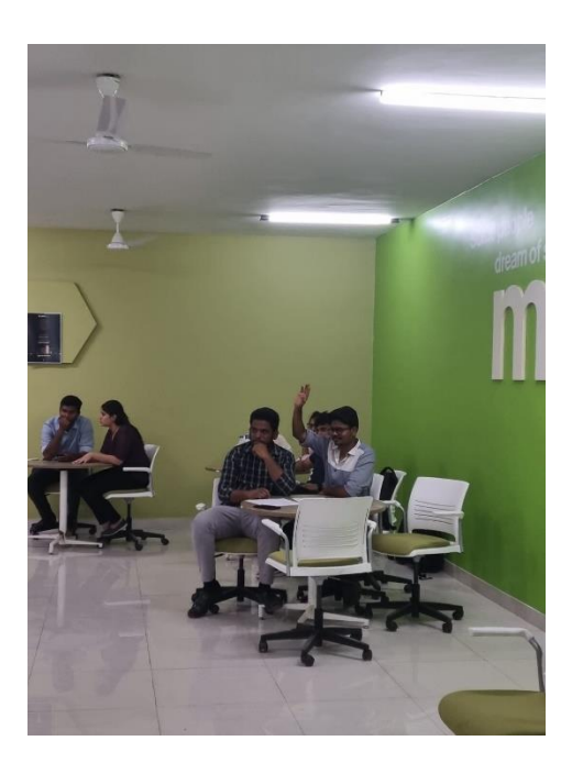
Fig – 1-above, One of the participating teams raising hand during Round 2.