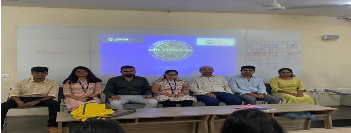
Fig : 1.1 Winning Team along with Ist and IInd Runners up of the Quiz on Financial Markets – Activity held on 28 th February, 2022 (Batch and Event: 2021-23; Programme: MBA II Sem Core Finance Section - CF1)