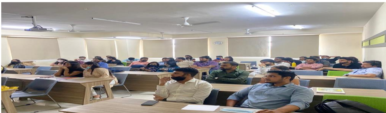
Fig 1.3 – Round 3 in progress with the participating teams in the Ist two rows.