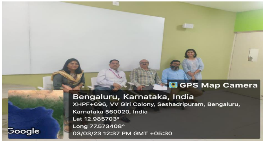
Fig : 1.2 HR Cruise Club activity on 3rd March 2022 for 2nd SEM Students (2022-2024)