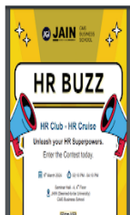
HR Cruise - March 24.png 81K