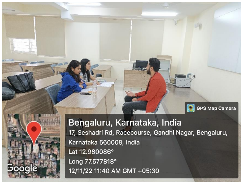
Fig : Pre- placement Training, Talent Acquisition Specialist, held on November 12 th 2022 (Batch and Event: 2021-23; Programme: III Semester CHR)