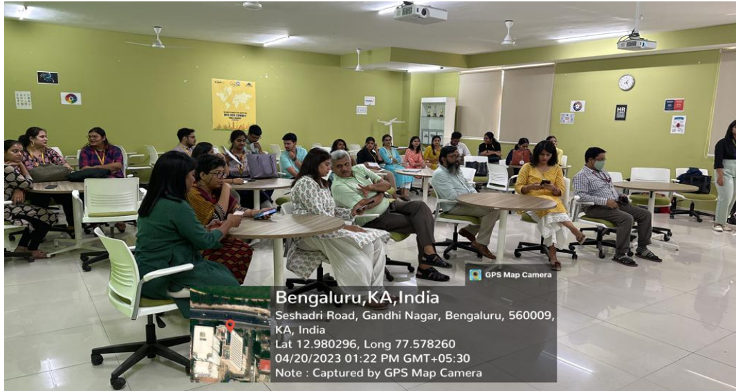
Fig : 1.1 HR Cruise Club activity on 20th April 2023 for 2nd SEM Students

Caption for the photographs to be returned as per the format forwarded from University IQAC Department for all the photographs in the reports for the period 2016- 2021