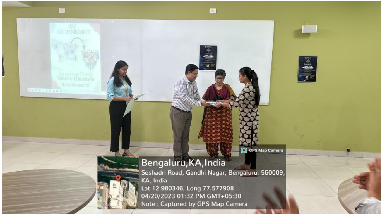
Fig : 1.5 HR Cruise Club activity on 3rd March 2022 for 2nd SEM Students