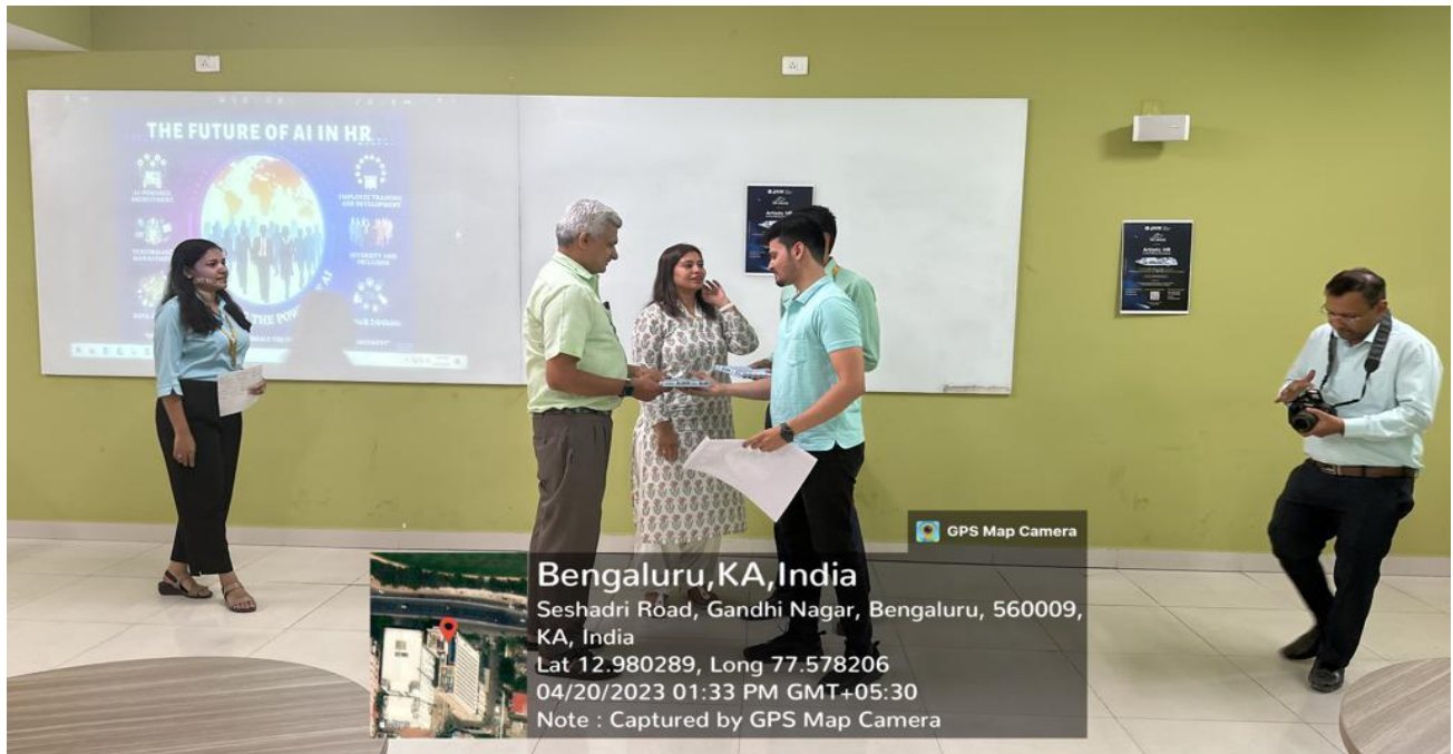
Fig : 1.4 HR Cruise Club activity on 20th April 2023 for 2nd SEM Students