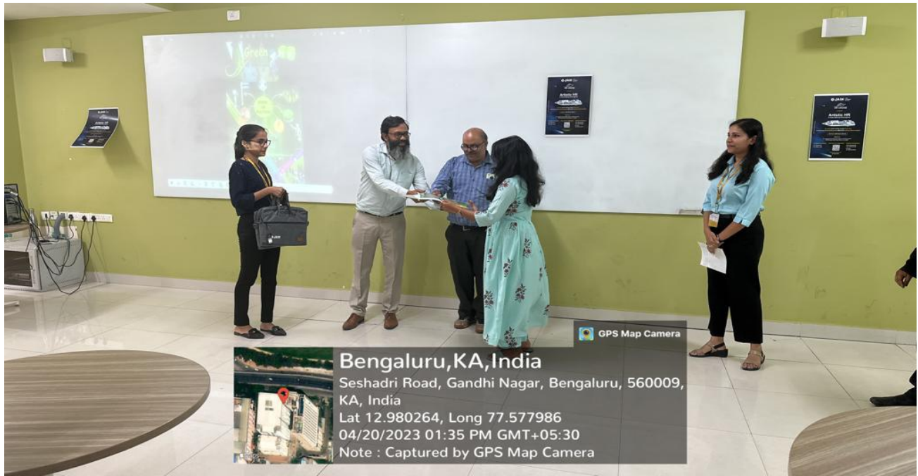
Fig : 1.3 HR Cruise Club activity on 20th April 2023 for 2nd SEM Students