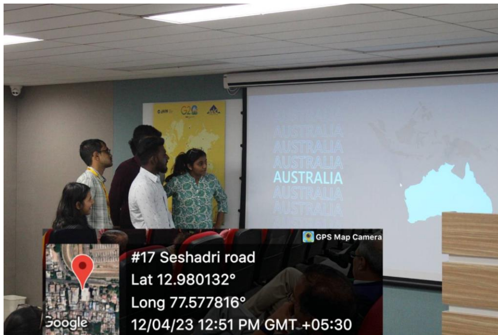
Fig: 1.2 Country allocation to the participating teams of MiG G20, MiG event, held on May 8, 2023 at CMS Business School (Batch and Event: 2022-24; Programme: MBA; Semester: II)