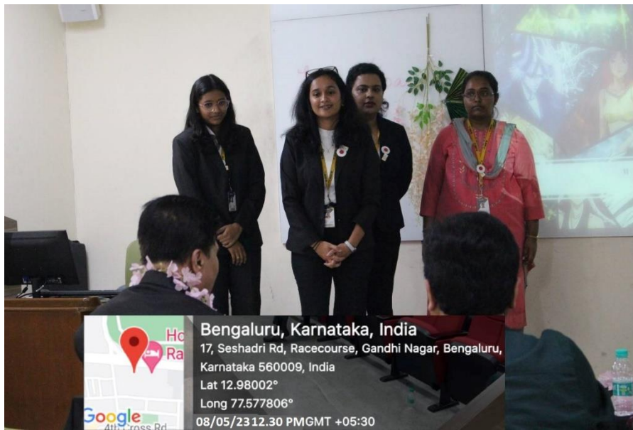
Fig: 1.4 Team Japan presenting their presentation pitch to the judges during MiG G20, MiG event, held on May 8, 2023 at CMS Business School (Batch and Event: 2022-24; Programme: MBA; Semester: II)