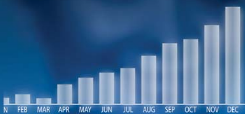
Projected sales of main products in 2013